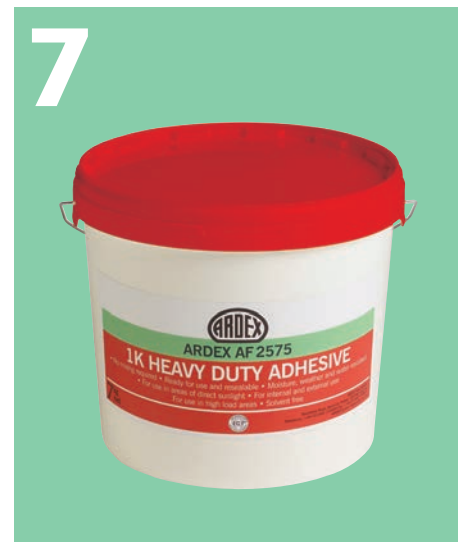
7 ARDEX AF 2575 Competition