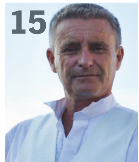
15 Meet the Team