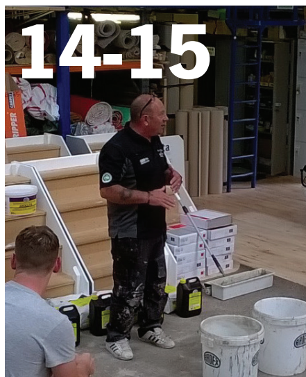
14-15 Win 1 of 6 Places on a FITA Training Course