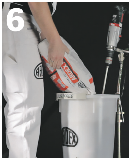
6 ARDEX DUSTFREE Competition Winners