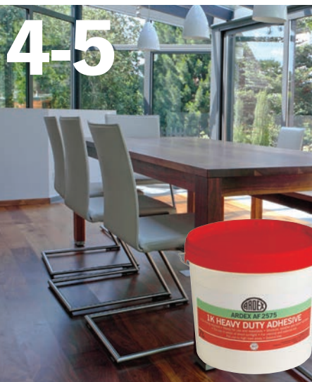
4-5 Installing Luxury Vinyl Tiles in Areas of High Temperature