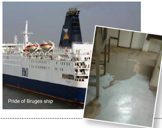
Pride of Bruges ship

"We used IMO approved ARDITEX NA on the Pride of Bruges, direct to the ship's metal deck without priming. Not many levelling products are approved for use on ships, and without the need to prime. We can walk away knowing it's going to stay bonded".